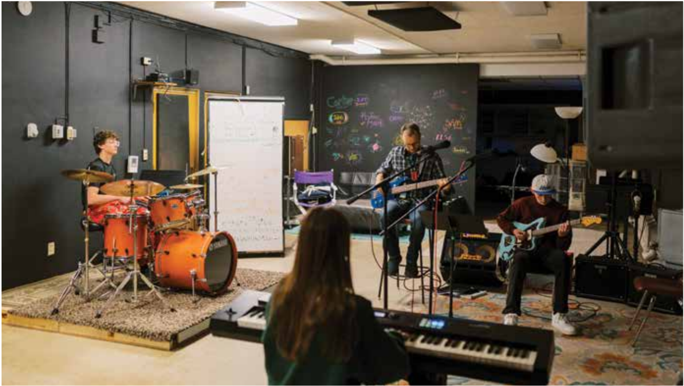
Students in a rock band at the Eastern Iowa Arts Academy rehearse during the Community Foundation's Greater Connection event, giving donors a behind-the-scenes look at the creativity and learning that takes place at the academy.